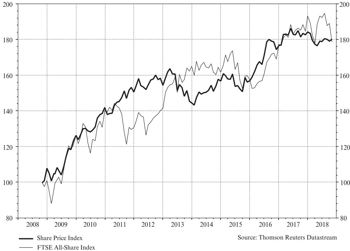
Share Price Total Return versus FTSE All-Share Index Total Return (based to 100)