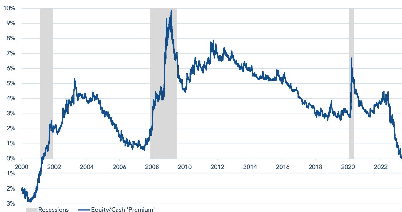
FIGURE 1 – US EQUITY EARNINGS YIELD PREMIUM TO FED FUNDS RATE

Past performance is not a guide to future performance.