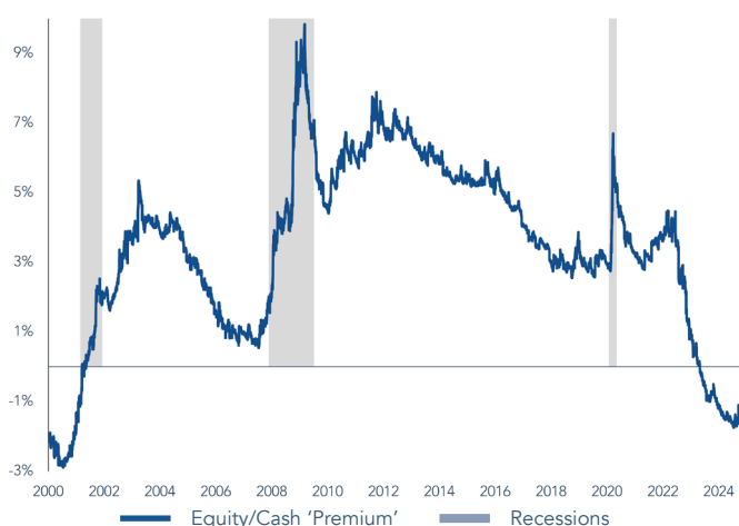
FIGURE 2 - US EQUITY EARNINGS YIELD PREMIUM TO FED FUNDS RATE

Source: Bloomberg, 31 October 2024. Earnings yield is the 12-month earnings divided by the share price. Earnings yield is the inverse of the P/E ratio. Earnings yield is one indication of value; a low ratio may indicate an overvalued stock, or a high value may indicate an undervalued stock.